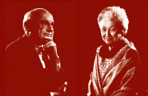
Dr. Milton Friedman, Founder Nobel Laureate and Founder